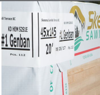
GENBAN & FURNITURE GRADE