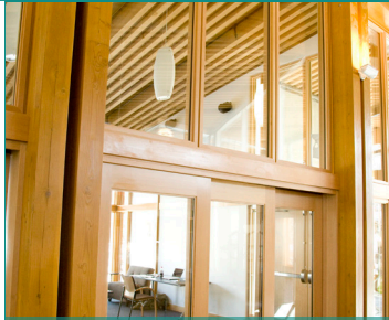
WINDOWS AND JOINERY